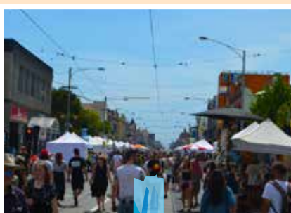
Sydney Road Street Party 2019