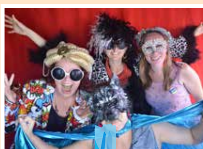
Sydney Road Street Party 2017