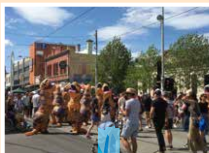
Sydney Road Street Party 2020