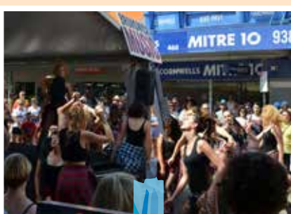
Sydney Road Street Party 2016