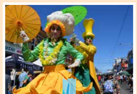
Sydney Road Street Party 2018