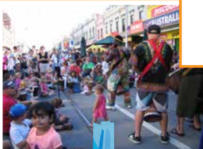
Sydney Road Street Party 2013