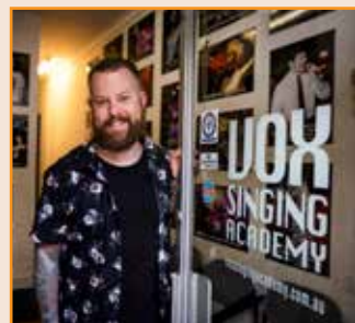
Vox Singing Academy @650