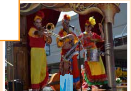
Sydney Road Street Party 2015