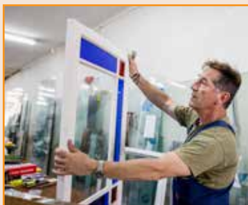
G & J Glass @485

For any businesses that weren't able to be involved this time, there will be plenty of future opportunities- so stay tuned.