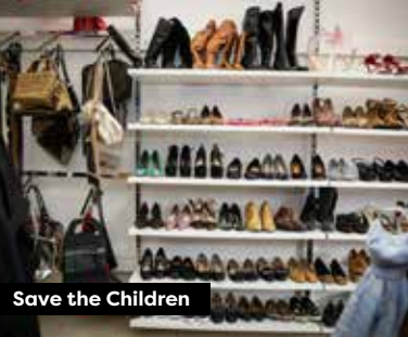
Save the Children