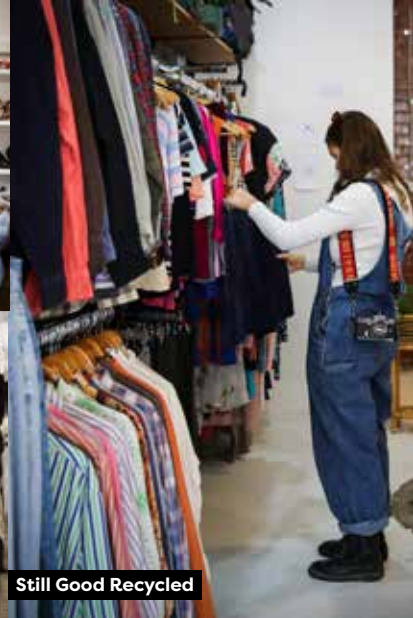
Still Good Recycled