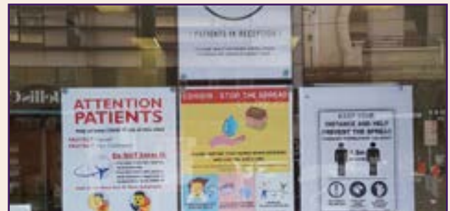
WINDOW DISPLAY SAMPLES