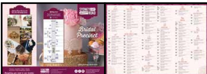
Bridal precinct brochure

The SRBA represented our bridal precinct for 3 days at the Melb. Wedding & Bride Expo (5-7 Oct), handing out the new Bridal brochures to hundreds of brides-to-be, along with their friends & families. The Sydney Road Bridal Brochure lists over 100 shops associated with the bridal industry. We'll soon be delivering the new brochures to businesses along Sydney Road, in preparation for the upcoming wedding season!