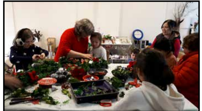
Workshop – Brunswick Flower Hub

SRBA organised more workshops again this Sept-Oct school holidays. Thanks to all the business who took part – Ratio Cocoa Roasters, Deans Art & Brunswick Flower Hub. If you have an idea for an in-store event or workshop, please contact us: 9380 2005