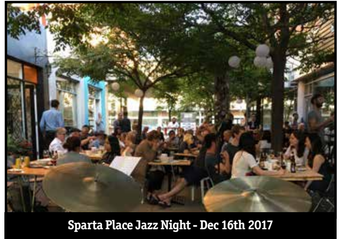
Sparta Place Jazz Night - Dec 16th 2017