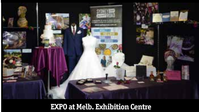
EXPO at Melb. Exhibition Centre