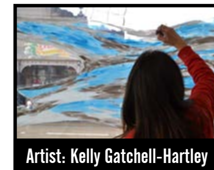
Artist: Kelly Gatchell-Hartley

A street front exhibition between Glenlyon Rd and Blyth St is coming up for 1 day only. People strolling along Sydney Road will be able to watch as windows along our shopping strip are